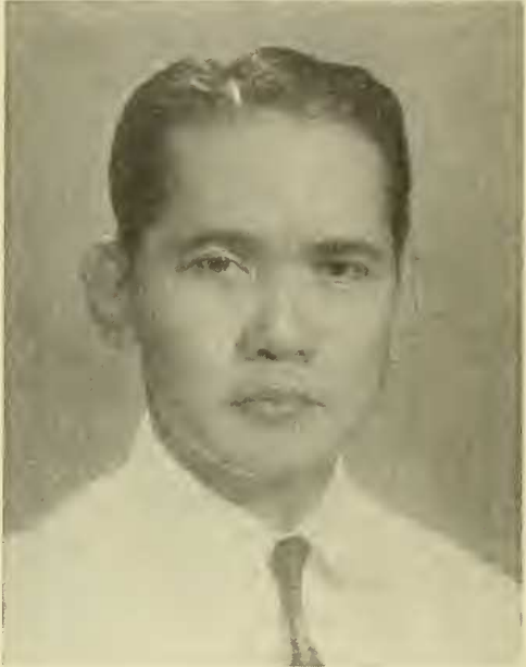
J. V. SANTOS

COLLECTIONS. The collection from Galang Island comprises 72 spermatophytes, 7 pteridophytes and some cryptogams. Present location not known to me.